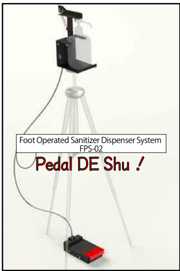
Foot Operated Sanitizer Dispenser System FPS-02